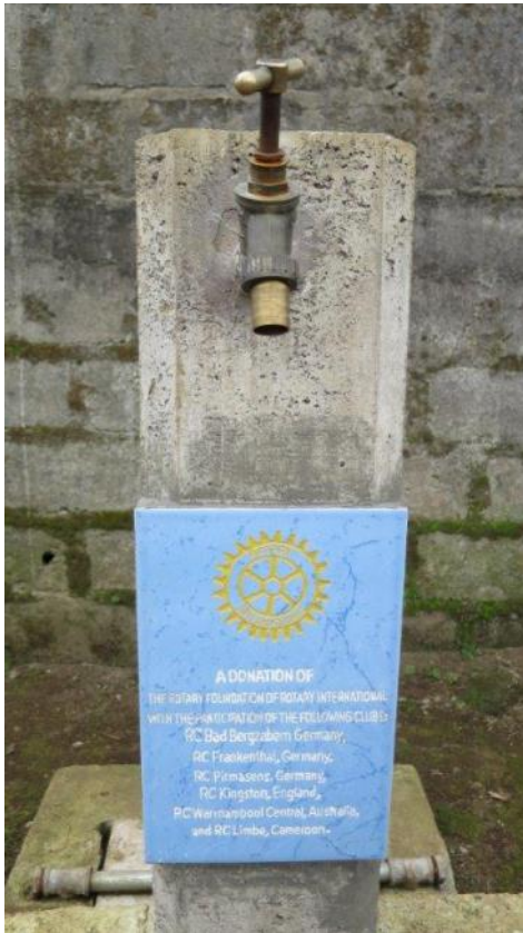
Kingston was one of six clubs helping to finance the project: The others were Bad Bergzabern, Frankenthal and Pirmasens in Germany, Warrnambool in Australia and Limbe in Cameroon